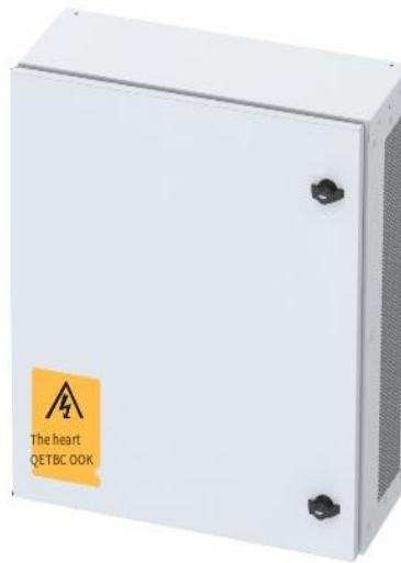
Figure 2-1 Exterior cabinet of an HTP48200 Y2A1 system

The cabinet dimensions in Figure 2-1 do not include accessories such as mounting ears.